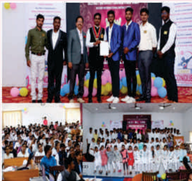
District Assembly of Rotaractors