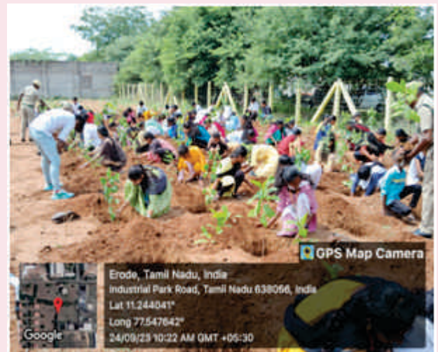
Plant sapling at Perundurai SIPCOT in connection with Erode Forest Department on 24.09.2023.